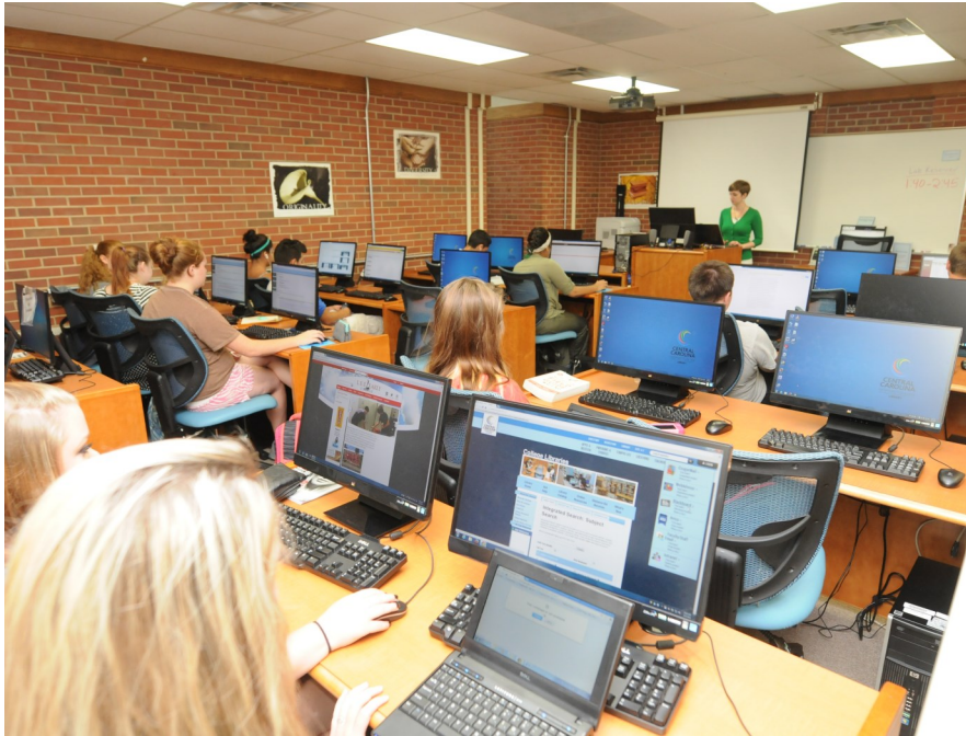
Students in class in the Lee Library computer lab