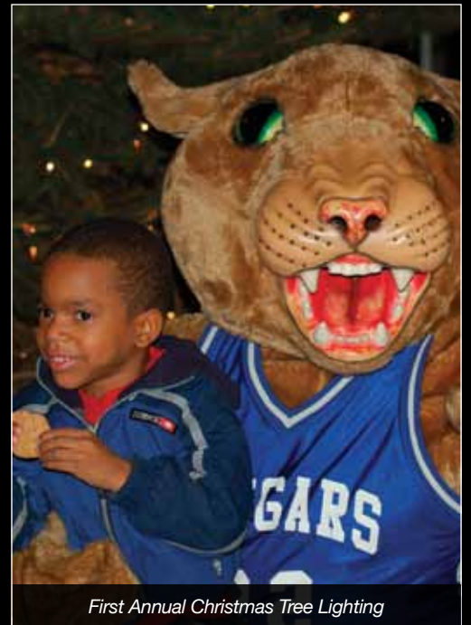
First Annual Christmas Tree Lighting