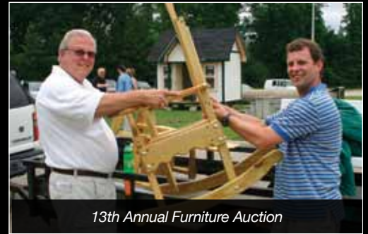
13th Annual Furniture Auction

Students in the Carpentry and Welding programs at the Harnett Correctional Institution hand crafted furniture and other home good items for the 13th Annual Furniture Auction. The Auction raised nearly $25,000 for the Harnett County Student Endowment.