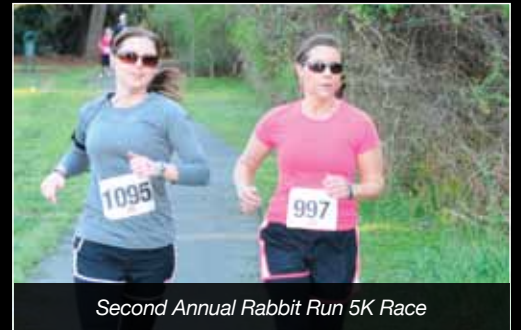
Second Annual Rabbit Run 5K Race