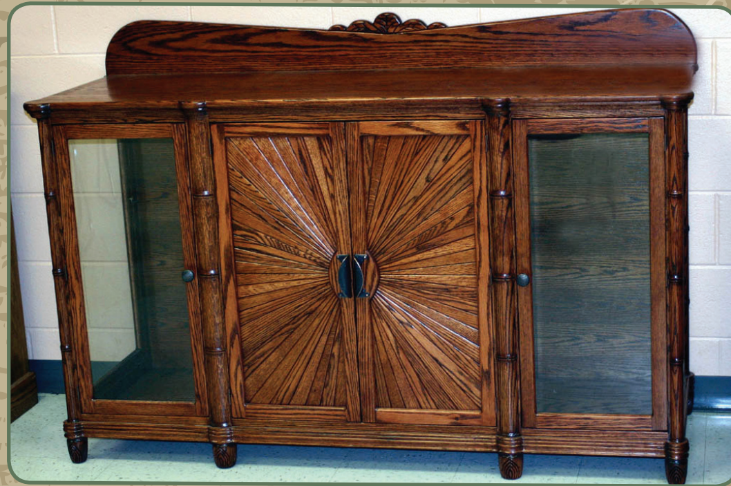
Handsome and well-made furniture was up for bid at the Foundation's seventh annual auction, in July 2008, including a beautiful, handcrafted oak buffet with glass doors. All pieces were made by students in the college's carpentry and welding classes at Harnett Correctional Institution.

"Part of our college's expectations for all students is that they will do some community service."