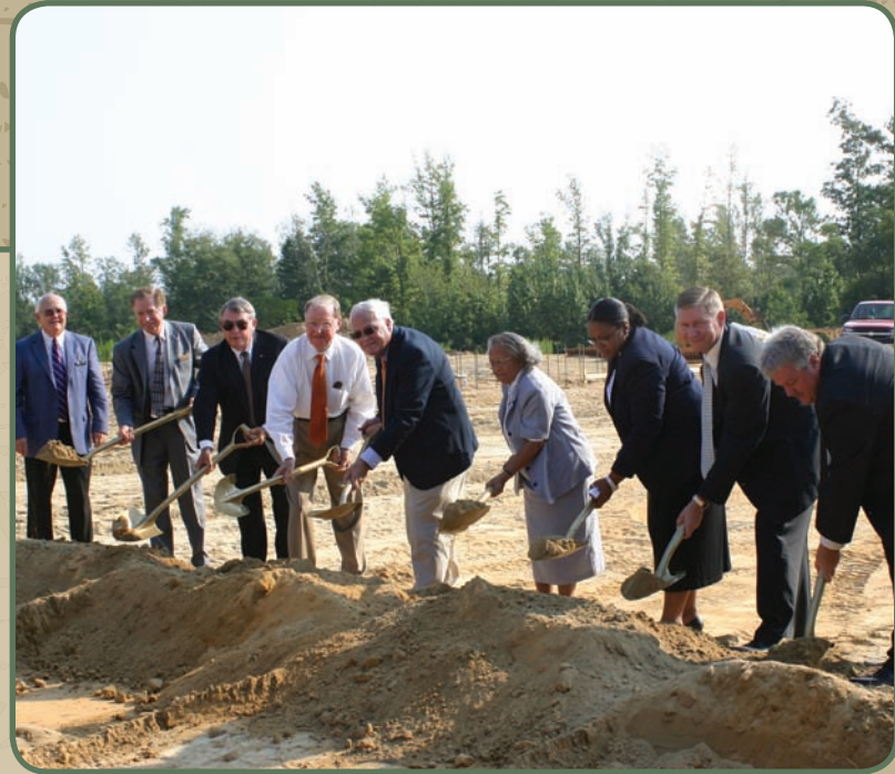
Central Carolina Community College, Harnett County and state officials broke ground September 6, 2007, for the college's new West Harnett Center, an 8,500-square-foot building in the Western Harnett Industrial Park.

The $1.97 million facility is being financed with $1 million from the 2000 State Bond referendum, a $647,620 grant from the North Carolina Community College System, and $325,200 in county funding.