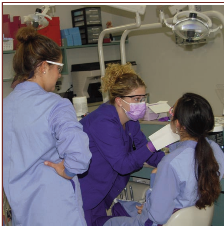
Dental Hygiene students practice their skills on each other. The college's new Dental Hygiene and Dental Assisting programs are accredited by the American Dental Association.

at the Lee County Emergency Services Training Center and continued long-range planning for the recently-acquired Kelly Drive land across from the existing campus. This year the College also began renovation projects at the Civic Center and several other