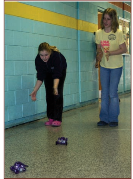
The CCCC Foundation helps to fund High Tech, High Touch workshops that involve middle school students in hands-on, fun learning about science.