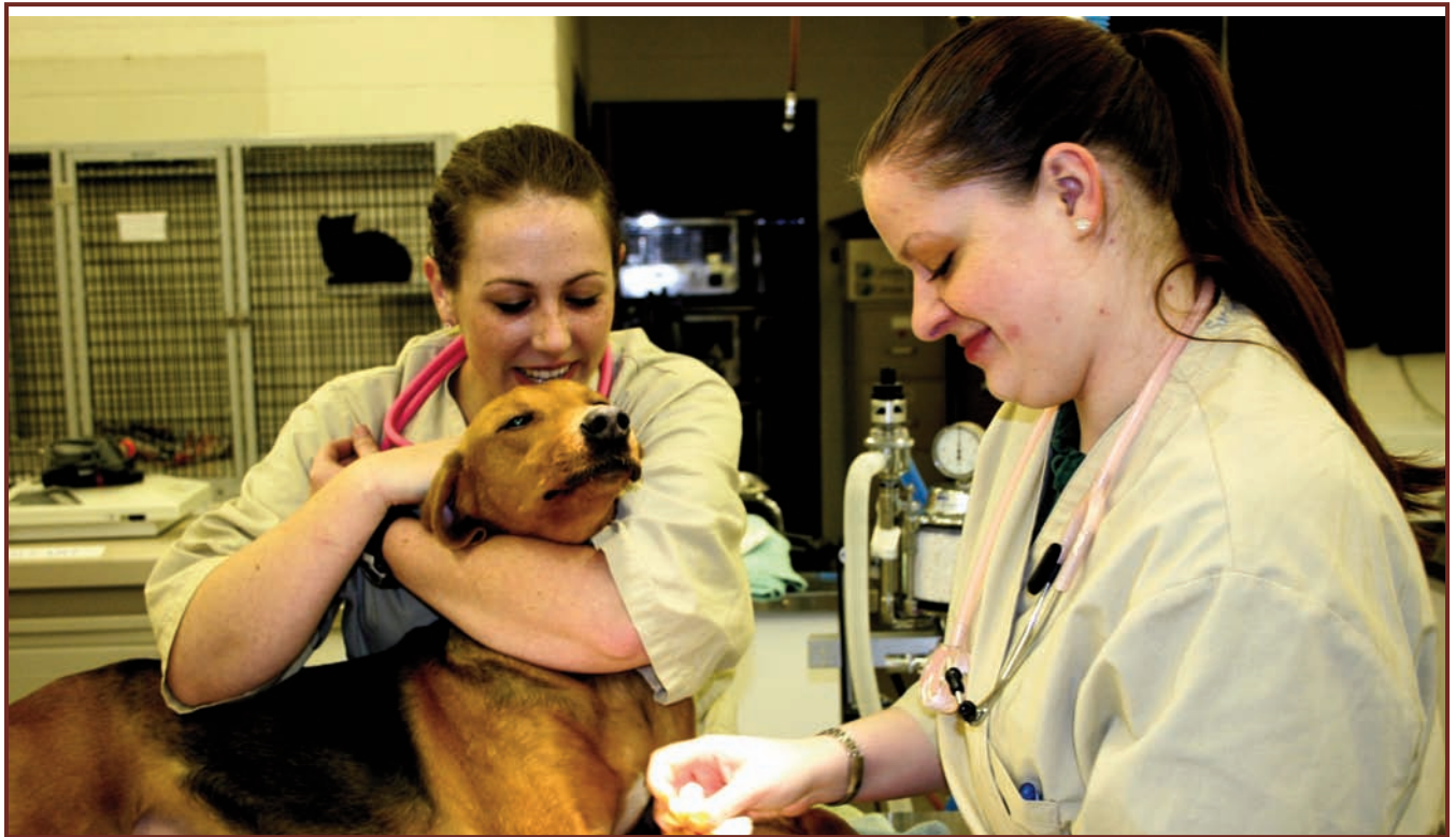
The college's Veterinary Medical Technician program moved into expanded, modernized facilities during the year. The interior of the old science building was gutted and re-created to specifically serve the needs of the Vet Med program.

unprecedented growth in 2006-2007 with an FTE (Full Time Equivalent) enrollment increase of 15.2%. This continues a steady FTE growth trend over the past five years. Growth in overall registrations for distance education courses has dramatically increased over a five-year period, from 1,745 in Spring 2003 to 2,861 in Spring 2007. To support increasing number of student enrolled in distance classes, the department began offering help center support in the evenings in person and via phone. The department also expanded faculty support this year by adding a Faculty