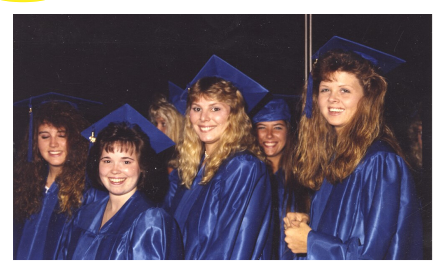
Vet Med students at graduation in 1992.

Find this and other photos of CCCC in days past at the NC Digital Heritage Center. They are continuing to digitize the library's archival photos, and currently provide access to over 3000 images from our collection! You can browse these at the Digital Heritage Center's website: