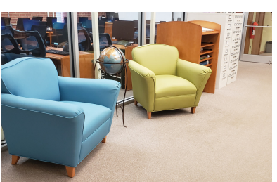
Seating is now available outside of the computer lab.

Over the summer, staff at the Lee Campus Library gave the library a fresh look by rearranging furniture in order to make seating areas a more inviting space for patrons. Additionally, some of the special collections were shifted to new locations to allow for easier browsing. With these items in their new shelving locations, we now have room to grow our collection and to create displays that feature our newest and most popular materials.