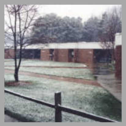
A snowy day on the Lee Main Campus in 1998.

Find this and other photos of CCCC in days past at the NC Digital Heritage Center. They are continuing to digitize the library's archival photos, and currently provide access to over 3000 images and 30 yearbooks from our collection! You can browse these at the Digital Heritage