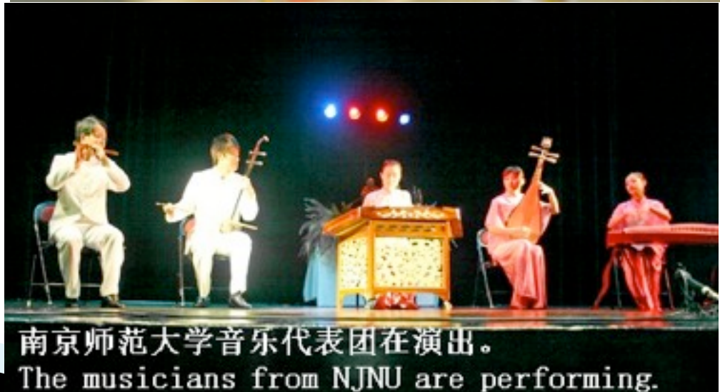
南京师范大学音乐代表团在演出。 The musicians from NJNU are performing.