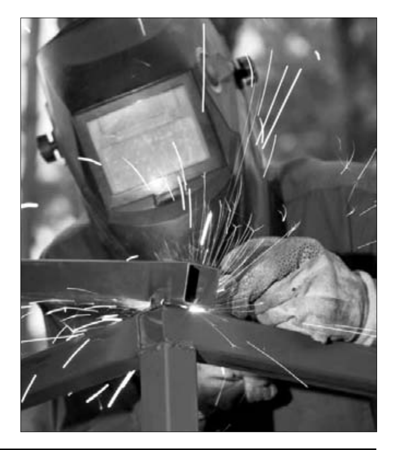
For registration information, refer to page 2. For location key, refer to page 3.