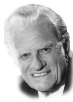
BILLY GRAHAM MY ANSWER

Send your queries to "My Answer," c/o Billy Graham, Billy Graham Evangelistic Association, 1 Billy Graham Parkway, Charlotte, N.C., 28201; call 1-(877) 2-GRAHAM, or visit the website for the Billy Graham Evangelistic Association: www.billygraham.org .