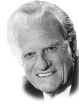
BILLY GRAHAM MY ANSWER

Send your queries to "My Answer," c/o Billy Graham, Billy Graham Evangelistic Association, 1 Billy Graham Parkway, Charlotte, N.C., 28201; call 1-(877) 2-GRAHAM, or visit the website for the Billy Graham Evangelistic Association: www.billygraham.org .