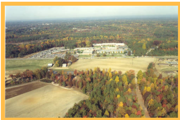
An aerial view of Central Carolina Community College's Lee county campus in the fall of 1990.

Find this and other photos of CCCC in days past at the NC Digital Heritage Center. They are continuing to digitize the library's archival photos, and currently provide access to over 3000 images and 30 yearbooks from our collection! You can browse these at the Digital Heritage Center's website: http://www.digitalnc.org/institutions/central-carolina-community-college/