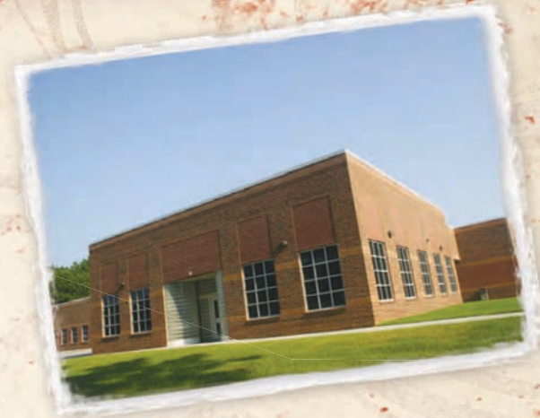
Harnett County Campus 1075 E. Cornelius Harnett Blvd. Lillington, NC 27546 (910) 893-9101