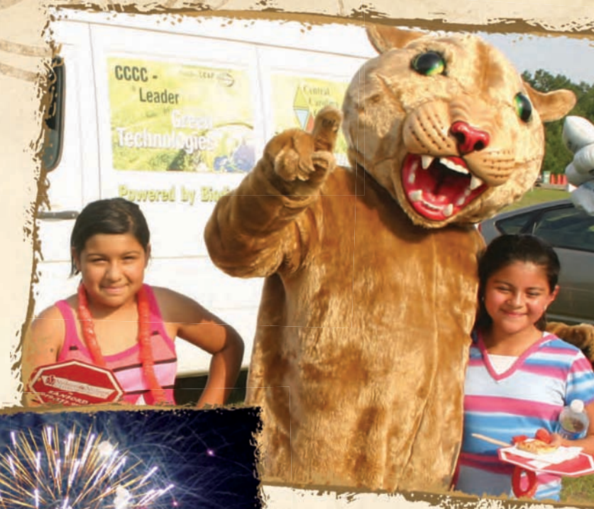
Charlee the Cougar, CCCC’s new mascot, entertains friends at the 50th event.

For fifty years, Central Carolina Community College has educated and enriched the area it serves and the lives of the individuals in it – and beyond. The abundant educational flowering of the college’s present time has grown from the deep roots of its past. From these will blossom the fruit of the future, nourishing, sustaining, and enriching our communities.