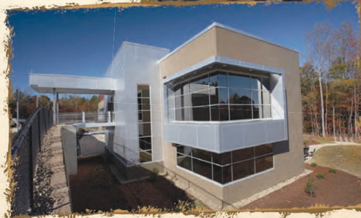
Education, government and community leaders and members gathered for the ribbon cutting/open house for the new Siler City Center.