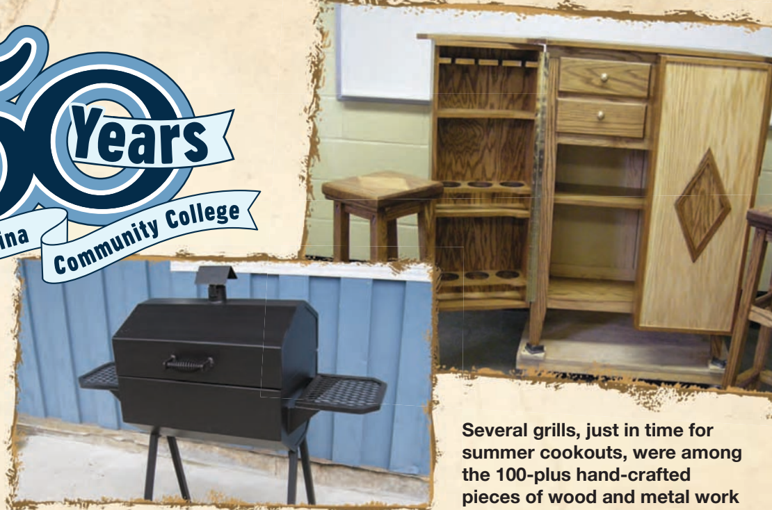
Several grills, just in time for summer cookouts, were among the 100-plus hand-crafted pieces of wood and metal work at the 11th Annual CCCC Foundation Furniture Auction.