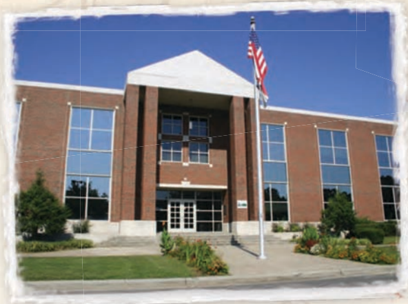
Chatham County Campus 764 West St. Pittsboro, NC 27312 (919) 542-6495