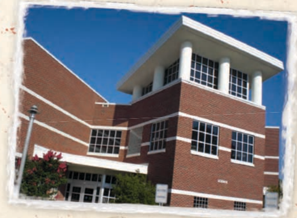
Lee County Campus 1105 Kelly Dr. Sanford, NC 27330 (919) 775-5401