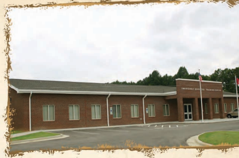
Central Carolina Community College’s Firefighter Academy is located at the college’s Emergency Services Training Center on Airport Road in Sanford.

“Cadets come out of the academy way ahead of the game,” he said. “All of the things they learn are things they’d have to learn one piece at a time, so having all of the certifications puts them that far ahead.”