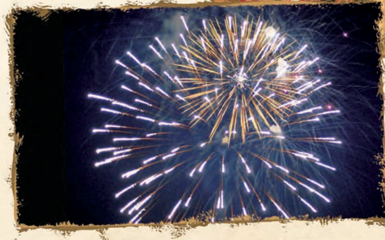
Fireworks exploded high above CCCC’s Emergency Services Training Center on July 23, 2011, as the college kicked off its 50th Anniversary celebration.