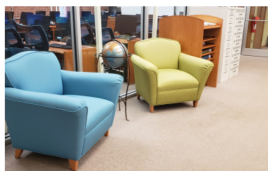
Seating is now available outside of the computer lab.

Over the summer, staff at the Lee Campus Library gave the library a fresh look by rearranging furniture in order to make seating areas a more inviting space for patrons. Additionally, some of the special collections were shifted to new locations to allow for easier browsing. With these items in their new shelving locations, we now have room to grow our collection and to create displays that feature our newest and most popular materials.