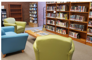
Seating has been rearranged to allow for easier browsing of nearby shelves.

The newest addition to the stacks is the basic skills section which contains materials at or below a grade 8 reading level. All of the DVDs have also been shifted, and this section now features two displays which will showcase some of the newest and most popular films. The makerspace cart has also found a new home beside the information desk and will now be available for use any time. Be sure to stop by the library and check out our cozy new seating areas, displays, and special collections. Don't forget to make a button while you are here!